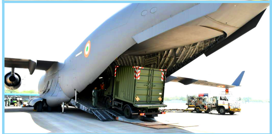
OxyTrucks from Collins arriving from Germany, on Indian Air Force's Pratt & Whitney powered Boeing C-17 Globemaster