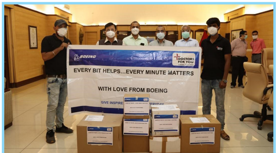
Boeing's Lucknow team received ventilators