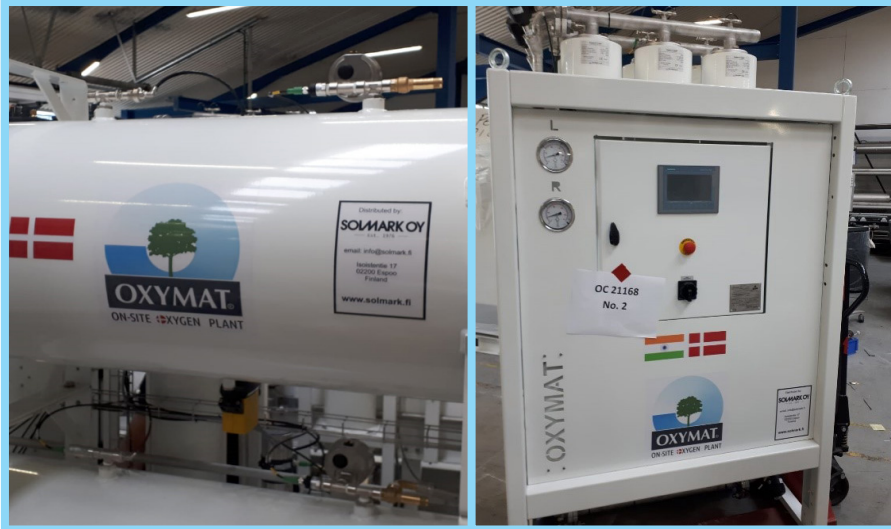
Oxygen Generation Plant (ref. image)

and life-saving equipment like ventilators. We are also setting up an oxygen generating plant, with a shelf-life of 20 years, in Bengaluru, which will cater to a hospital's oxygen requirement for almost 50 patients, at any given day. We also joined government's campaign #PehnoSahi to spread awareness on the right way to wear a face mask and on proper disposal of single-use masks.