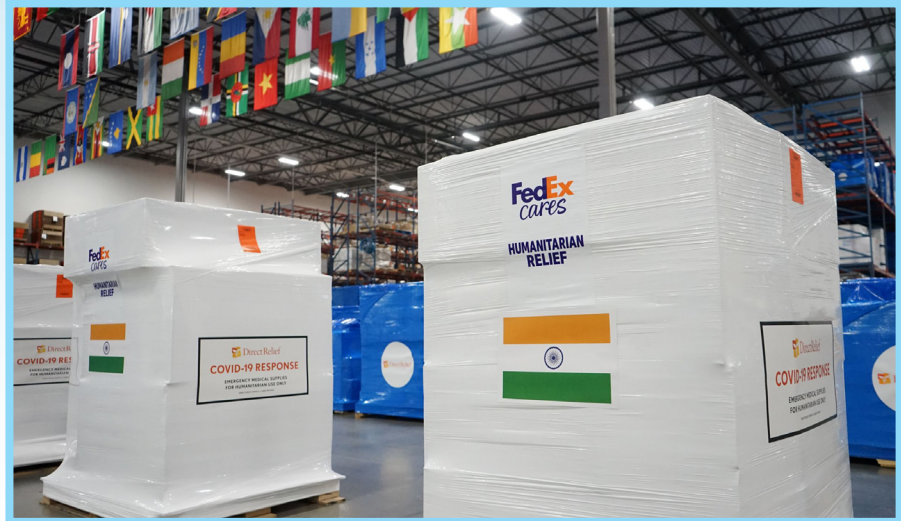
FedEx delivering critical COVID-19 Aid to India

FedEx Express, a subsidiary of FedEx Corp., and the world’s largest express transportation company, has been working with organizations around the world to deliver critical medical supplies and